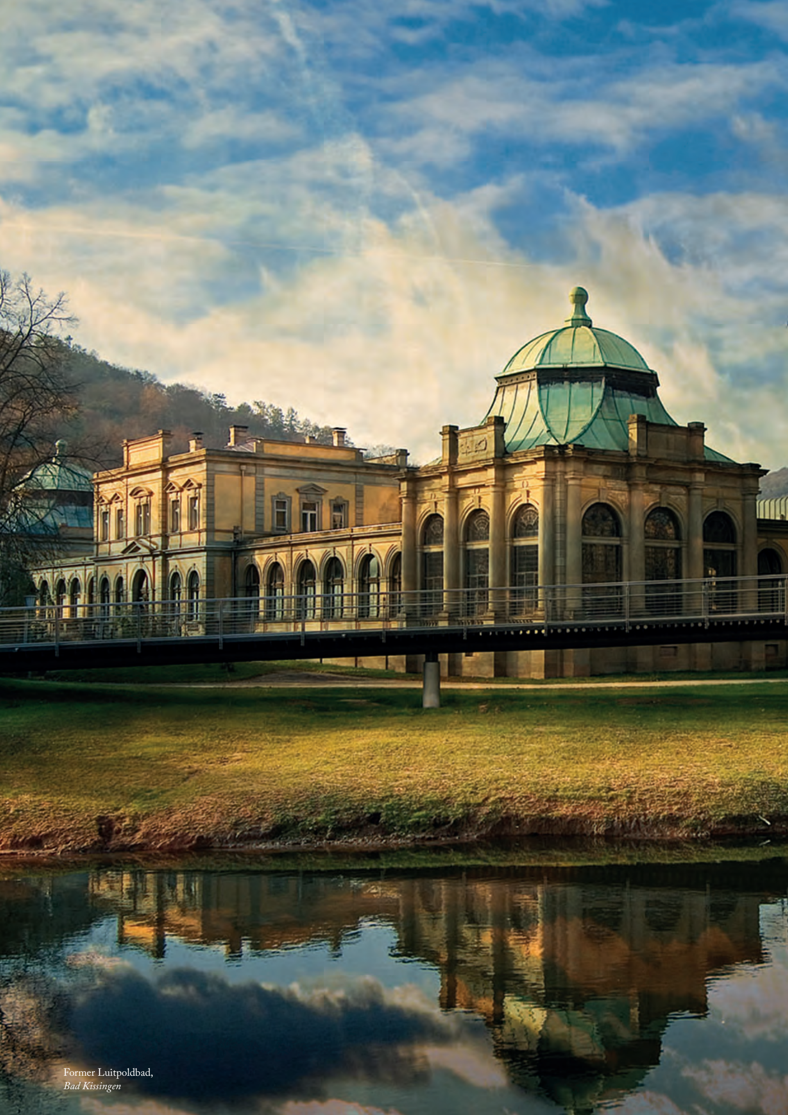
Former Luitpoldbad, Bad Kissingen