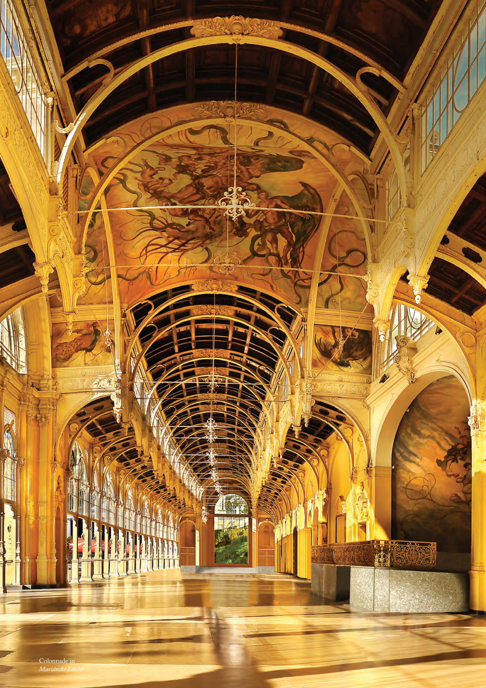
Colonnade in Mariánské Lázně